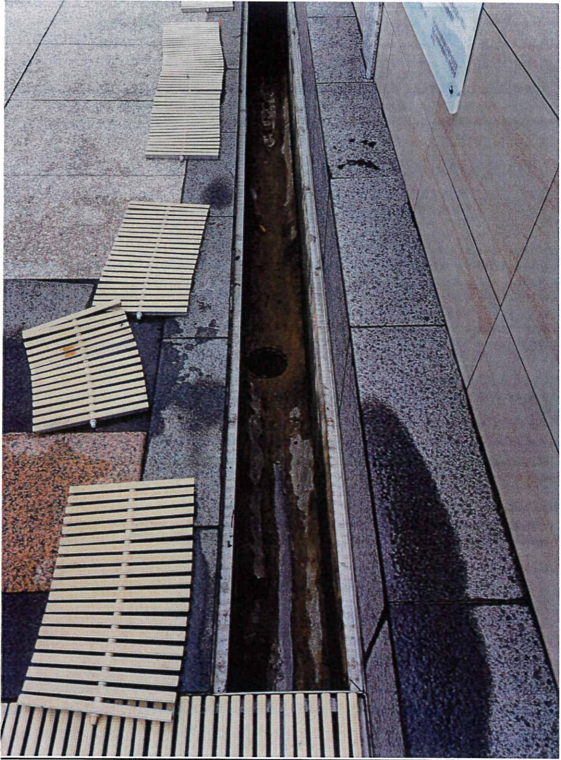
Swimming Pool U-Channel (View 1)